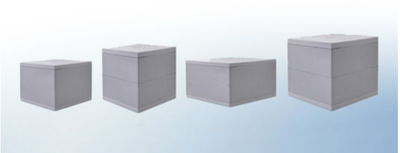
M (21 liter), L High (43 liter), L Flat (45 liter), XL (91 liter) (from left to right)